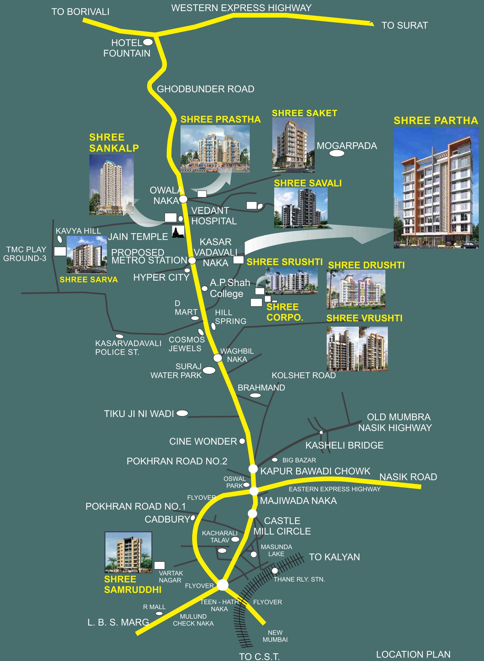
LOCATION PLAN NOT TO SCALE