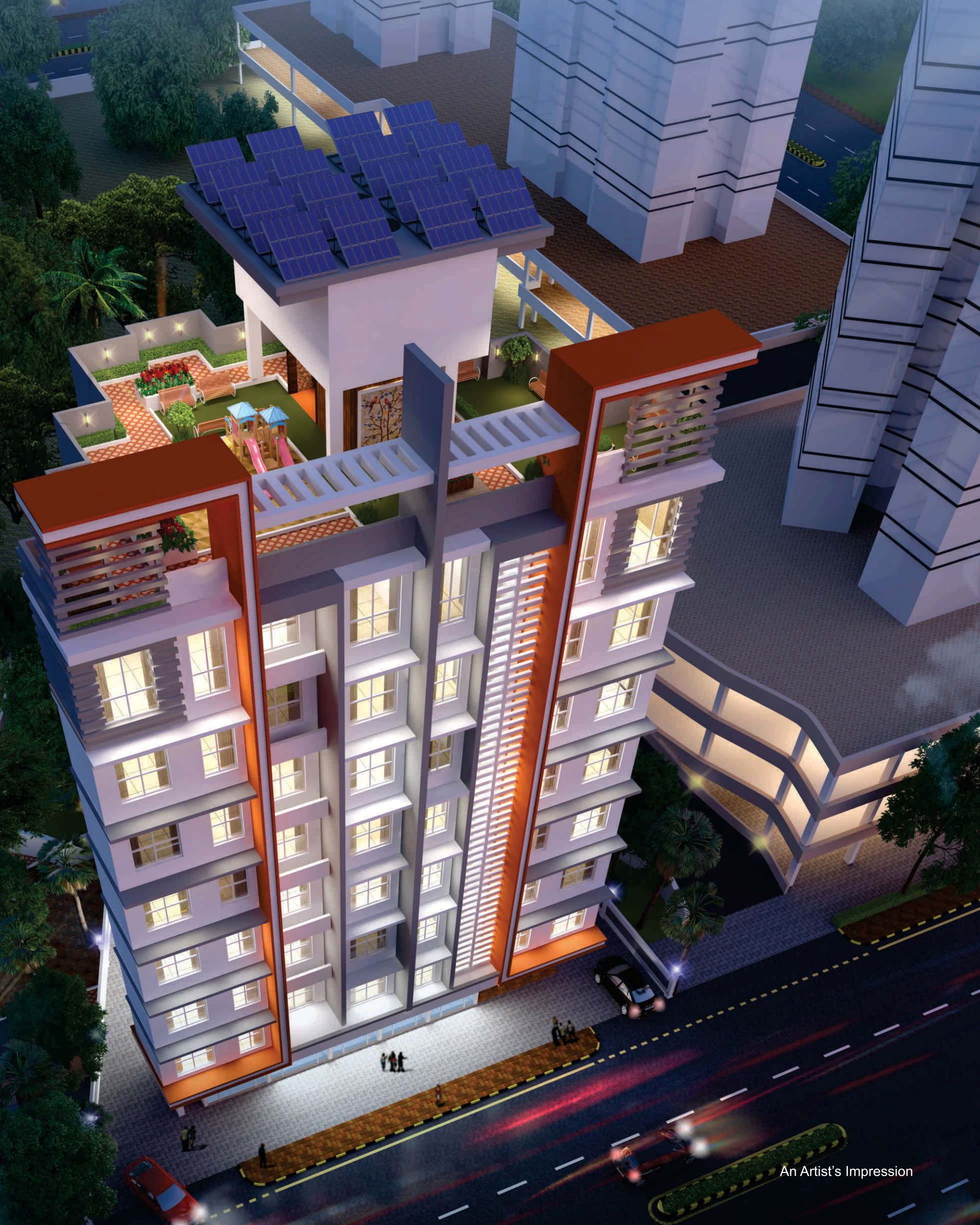
An Artist's Impression